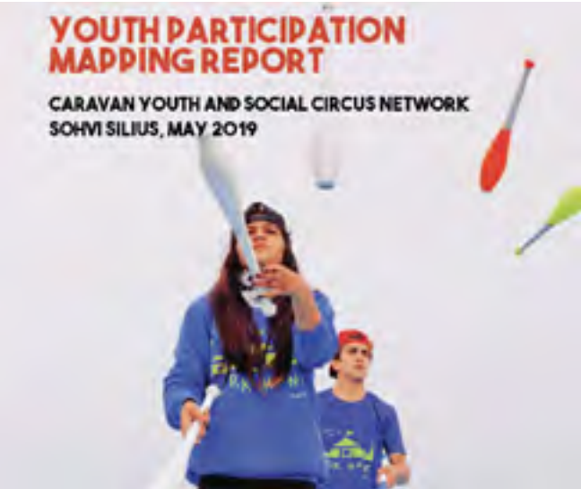
The report is available on Caravan's website