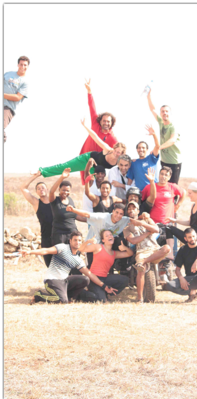
Part of the Belgian training session took place in Morocco where the picture was taken.